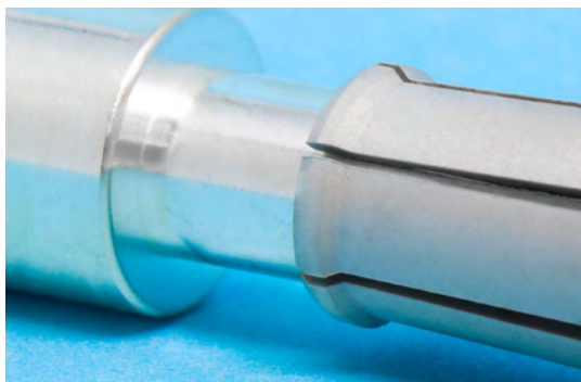
Pin and socket contact system: pin silver coated; socket ARGONGLIDE®

The other members of the group are located in Aegerten, including Estoppey-Reber SA, Akrom SA and Galvаметal SA. The four companies are active in electrochemical and chemical surface treatments as international leaders in the electroplating industry.