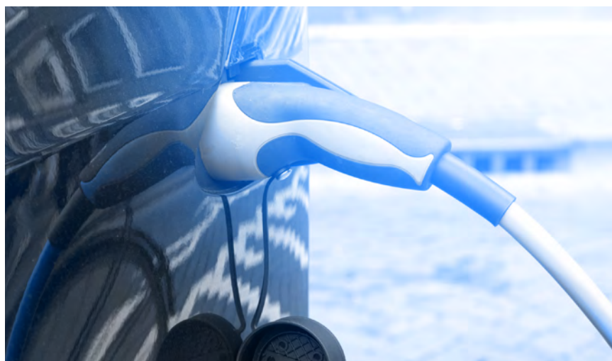
Low voltage, high current, low friction plug for car battery charging.

ARGOGLIDE®, coating allows more than 25'000 mating cycles of contacts Pin & sockets for battery charging. Contact systems are significantly improved in terms of plug cycles and reliability in comparison to commonly applied connecting technology.